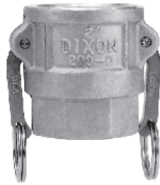
female coupler x female NPT