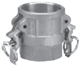
female coupler x female NPT