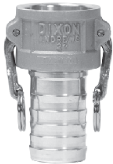
female coupler x hose shank