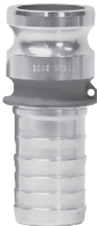
male adapter x hose shank