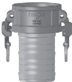
female coupler x hose shank