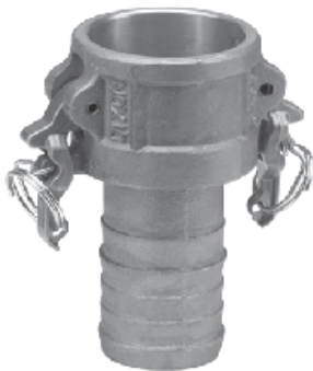
female coupler x hose shank