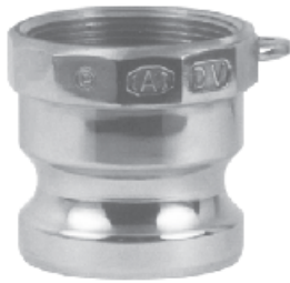
female NPT x male adapter